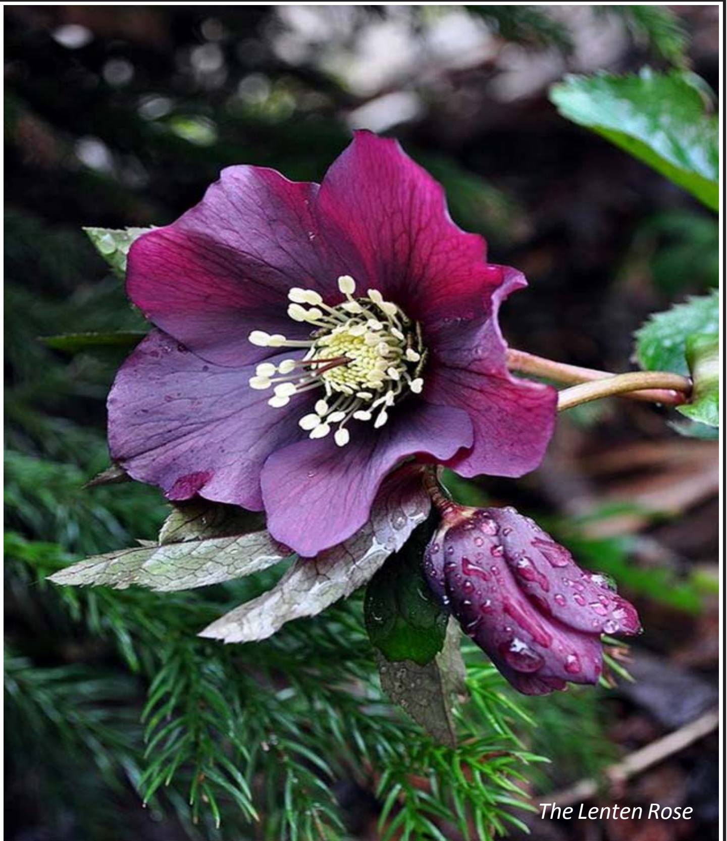
The Lenten Rose